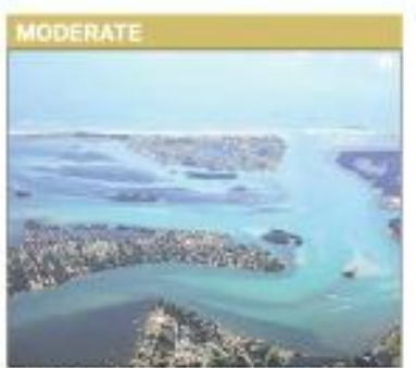
Two subtropical rivers, the St. Lucie and Indian, where uninhabited Islands and sandbars divert the flow of water before flowing into the ocean, continuous or

On Hutchinson Island, visit the 57-acre Florida Oceanographic Coastal Genter for a family-friend-by day of fun and learning — with squariums, guid-ed walks on nature trails, a lagoon, butterfly guiden, touch tanks and a children's pavilion; $12 adults; $6 ages 3-12, 800 N.E. Ocean Brid., 772-225-0505, www.floridaccean.org. Grab a mask for a morried adventure at Rathitub Reef Beach, where a man-made neef extends into the ocean while remaining in a pro-