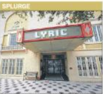
The legacy of old Florida lives on in Martin County. Catch a show at downtown Stuart's historic Lyric Thestre, named to the National Register of Historic Places

Touted as the most blodiverse lagoon ecosystem in the Northern Hemisphere is St. Lucie Inlet—a habitat for more 4,300 species of plants and animals, including more than 30 threatened and endangered species such as mastaires, wood storke, sand hill cranes and pergrine falcons. Located between Hurchinson Island and Jupiter Island, it's one of six inlets into the Indian River Lagoon and a best-kept South Florida secret. Take a three-hour guided kay ak tour through a mangrove forest, in acarch of man-atees and dolphins; $75 per person, 772-209-5899, www.tckayakfishing.com.