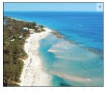
A reef near the shore creates shallow pools at Bathtub Reef Beach. The beach on South Hutchinson Island has a bathhouse, ... Read More

www.DiscoverMartin.com for trip planning.