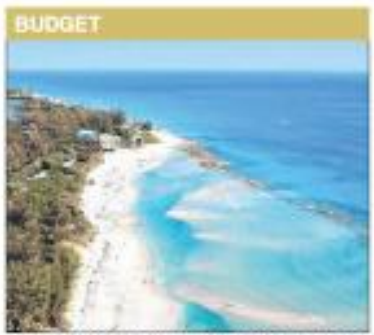
A reef near the shore creates shallow pools at Bathbub Reef Beach. The beach on South Hutchinson Island has a bathhouse, a picnic payillon and an inland fishing pler.

ries, preserving views throughout the county and offering Old Florida charm and Key West style. Upcoming events include the Sailfish Regatta in May and the Jensen Beach Pineapple Festival in October. Visit www.DiscoverMartin.com for trip planning.